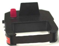
T-4U Cassette Ribbon