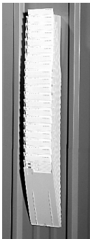
Time Card Rack